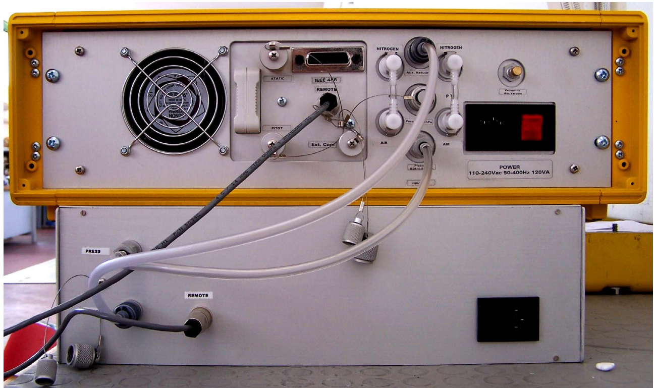
FIG. 3 MPS 36 - EPSR1 CONNECTIONS